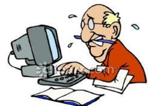
Site page views